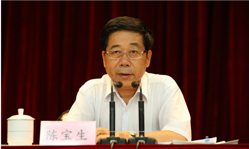
Chen Baosheng Minister of Education President of NEA