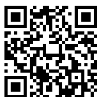
Online Referencing Tool