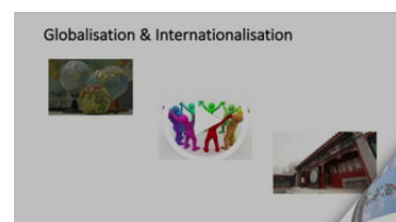
LEAD2 PROJECT INTRO VIDEO (BRUSSELS MARCH 2019)